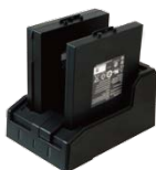
2-bay Battery Charger