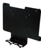
VESA Mount Bracket